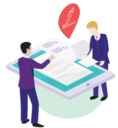
Ready to eClose!